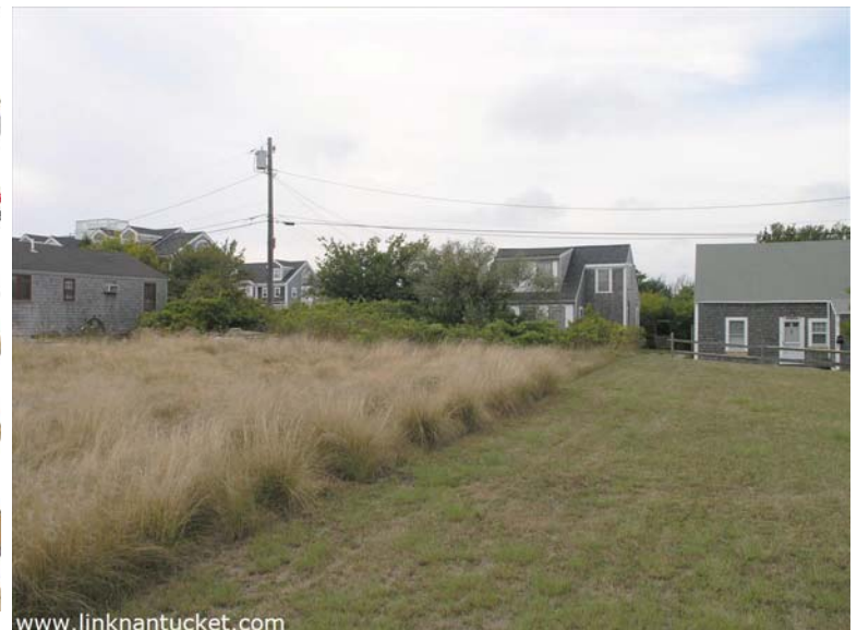
View from Rear of lot toward Daves St