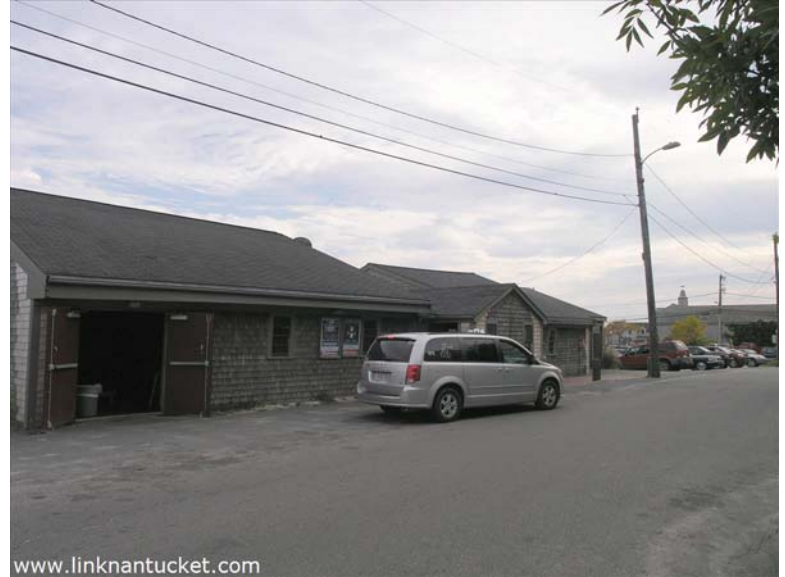
World famous Chicken Box