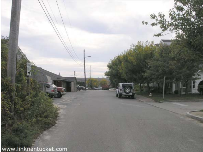
Street View toward Stop and Shop