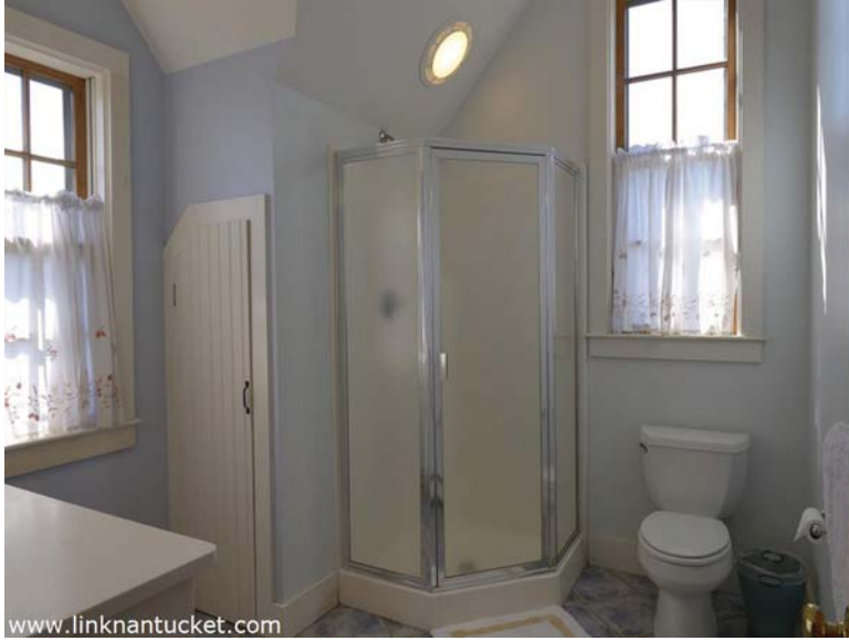
cottage second floor guest shower bath