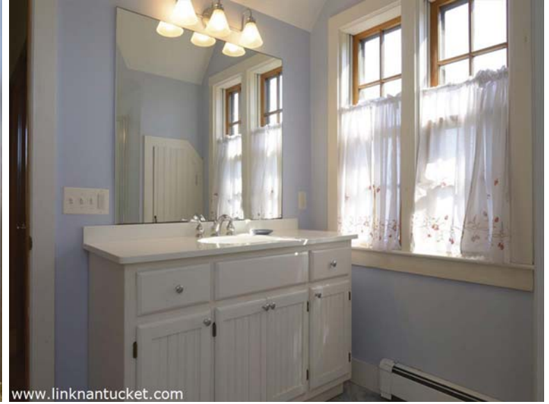
cottage second floor guest shower bathroom