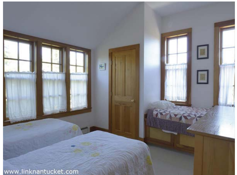
cottage second floor guest bedroom