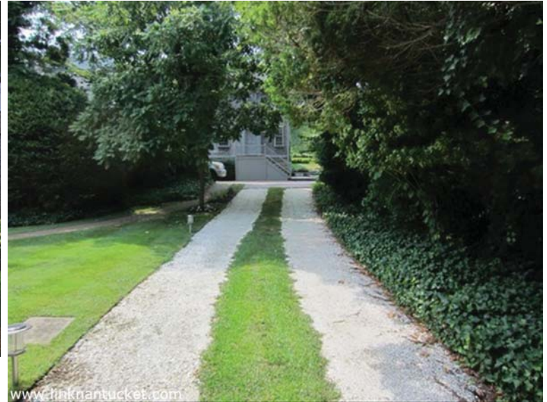
White Shell Driveway from Union Street