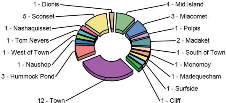
Properties Sold By Area