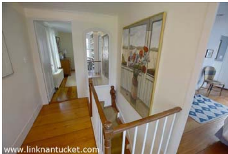
2nd floor hallway