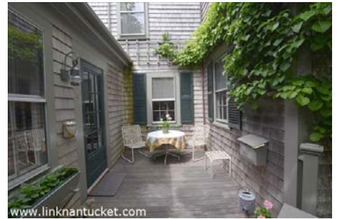
Perfect spot for morning coffee