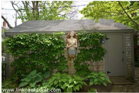
Mermaid on garage