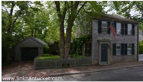
View from across the street