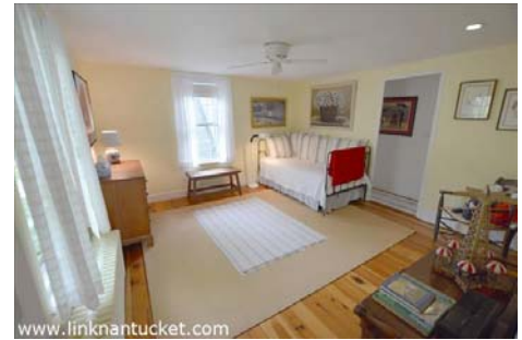
Guest Bedroom 2