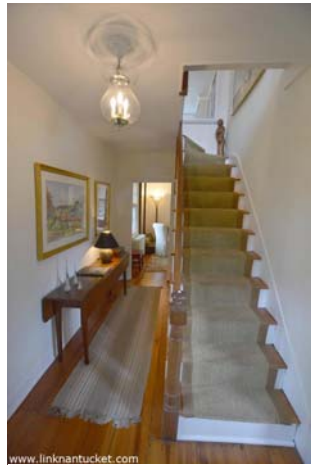
1st floor hall to front door