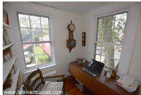
2nd floor landing/office