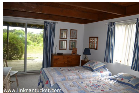
First floor bedroom with sliders to deck.