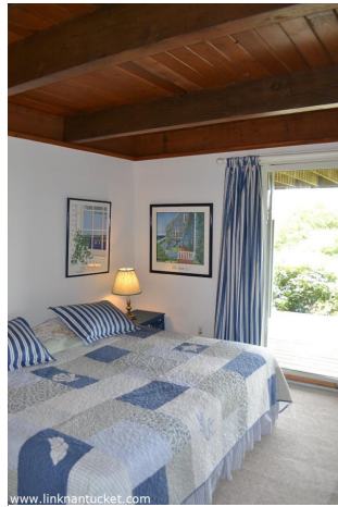
Second floor bedroom with slider to deck.