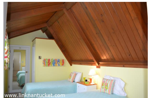
Third floor bedroom with half bath and vaulted ceiling.