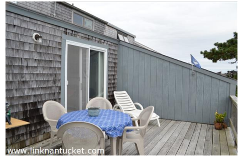
Second floor deck