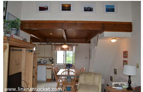
View of kitchen from living room.