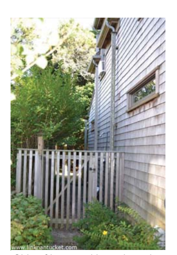
Side of home, with outdoor shower