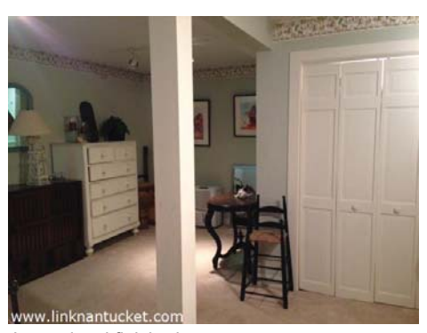
Lower level finished space