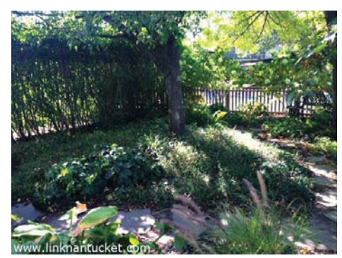
View from front stoop, looking towards street.