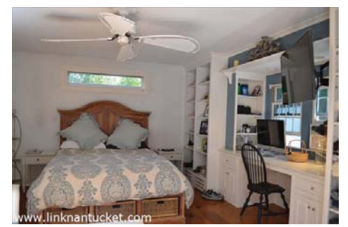
First floor master