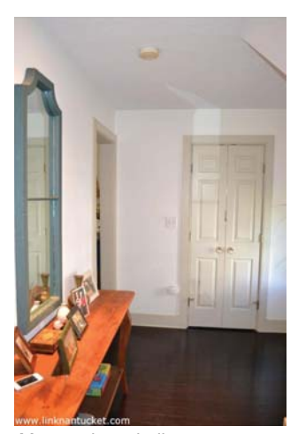
Master closet hallway