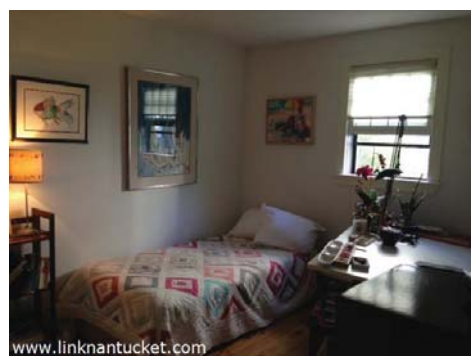
First floor bedroom.