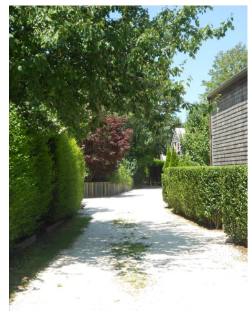
Shell Lane - Howard Court