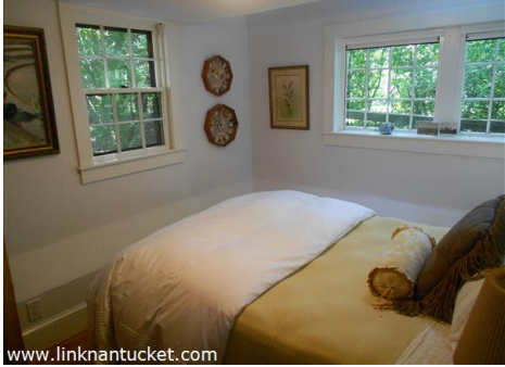
First Floor Bedroom