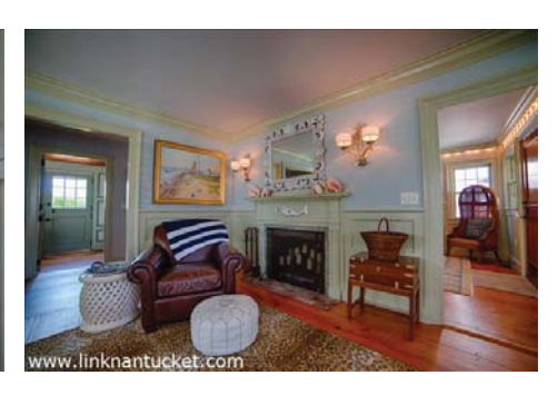
Foyer Gourmet Kitchen Living Room