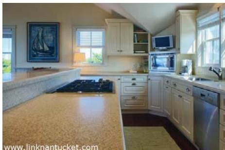
The Kitchen also enjoys easterly water views toward Wauwinet Harbor