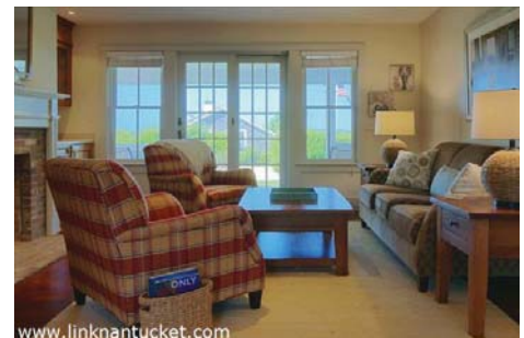
First Floor Den with fireplace, wetbar, and French sliders to a covered porch with water