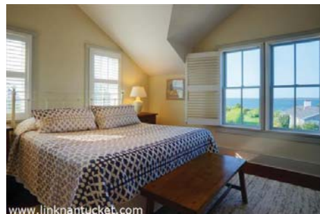
Second Floor Master Bedroom Suite with lovely harbor views toward Coatue and Town