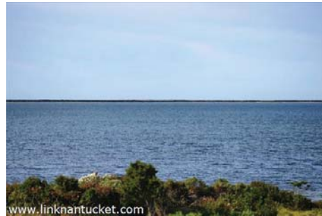
Expansive views of the Harbor, Coatue and Great Point Light