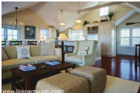
Living Room view toward kitchen/dining area, both with excellent harbor views