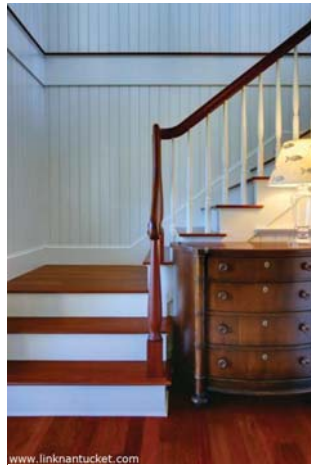
Entry Foyer with gorgeous wainscoting detail