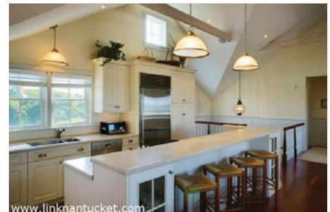
Gourmet Kitchen with spacious breakfast bar and top of the line appliances