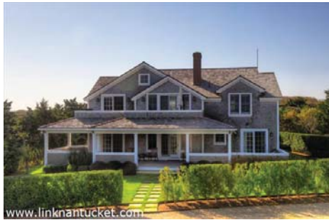
7 Village Way ("Homeport")