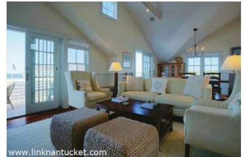
Second Floor Living Room with stunning harbor views, deck access and beautiful