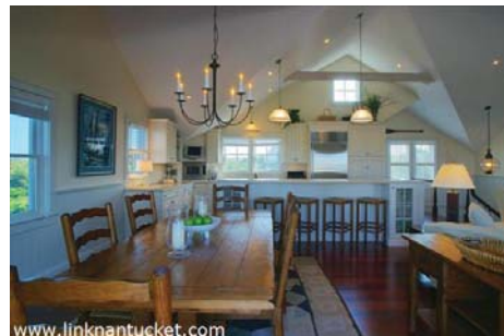
Dining Room also enjoys access to the porch and excellent views for harborside dining