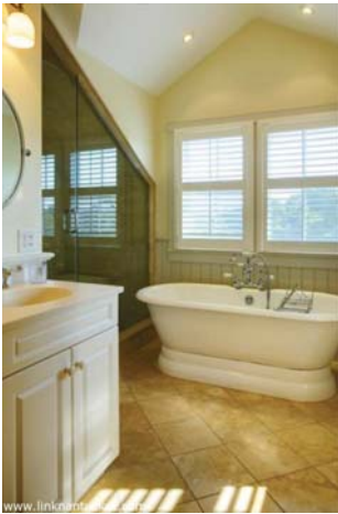
Master Bathroom Suite