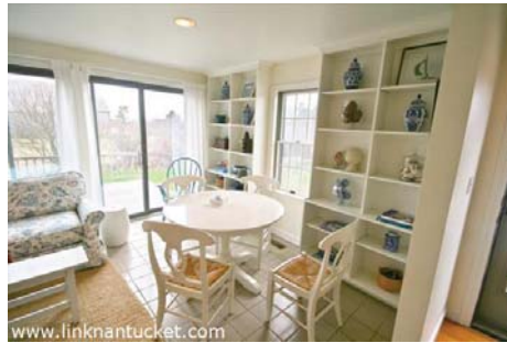
Dining area at TURF