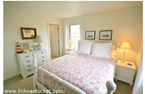
First floor ensuite bedroom at TURF