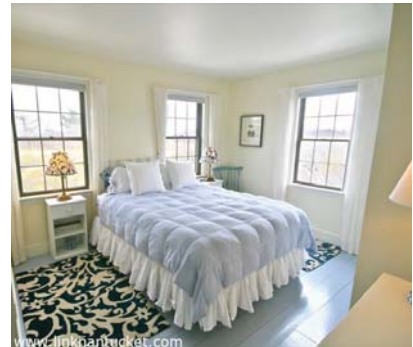
First floor ensuite bedroom at SURF