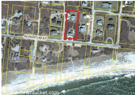
SURF & TURF