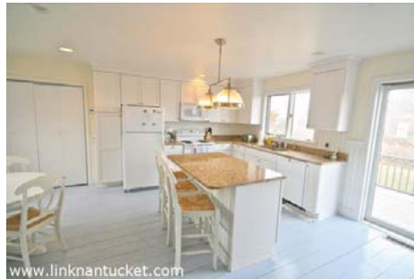
Kitchen with access to one of two decks at SURF