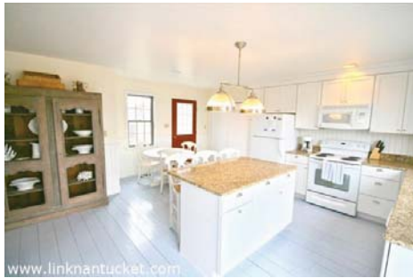
Kitchen and dining area at SURF