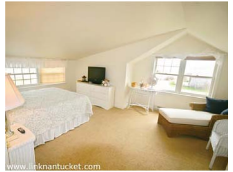
Spacious second floor bedroom at TURF