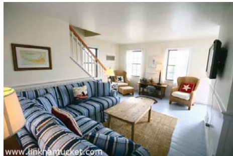
Living room at SURF