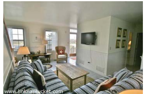
Living room at SURF