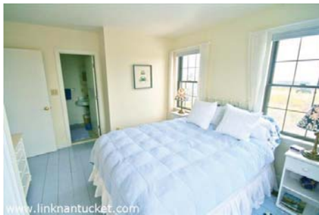
First floor bedroom showing the attached bathroom with a shower at SURF