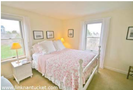
First floor ensuite bedroom at TURF