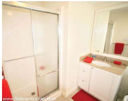
First floor ensuite bathroom at TURF