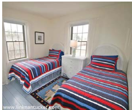
First floor bedroom with twins at SURF