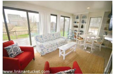
Living and dining area at TURF