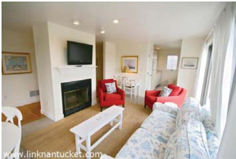
Living area with a fireplace at TURF