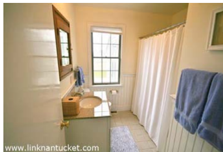
First floor hall bathroom at SURF