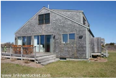
Side deck at TURF