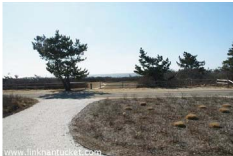
Standing at the front door of SURF looking at the beach path across the street