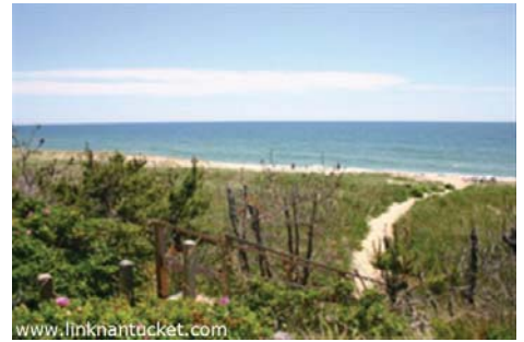
Land Bank property located directly across the street