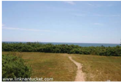
The path leading down to Fishermans Beach