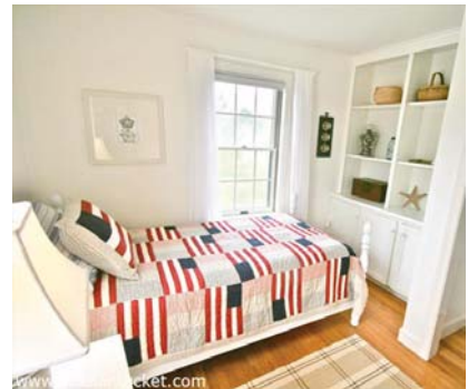
First floor with built-in shelving at TURF