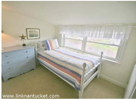
Second floor bedroom with a single bed at TURF