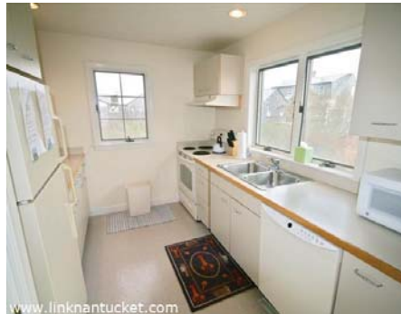
Kitchen at TURF