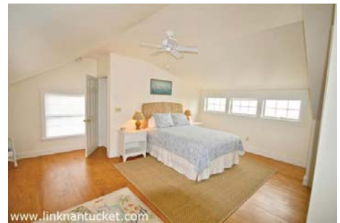
Second floor bedroom with ocean views at SURF