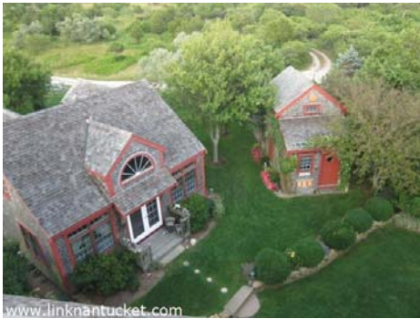
www.linknantucket.com Cottage and carriage house.