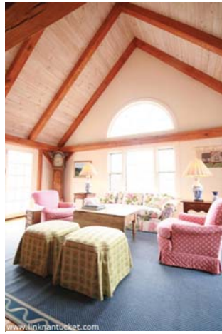
Second floor family room.