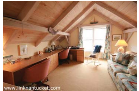
Third floor bedroom.