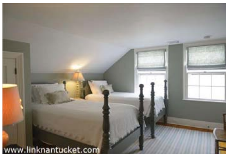
2nd Floor Bedroom