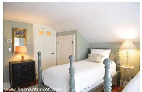
2nd Floor Bedroom