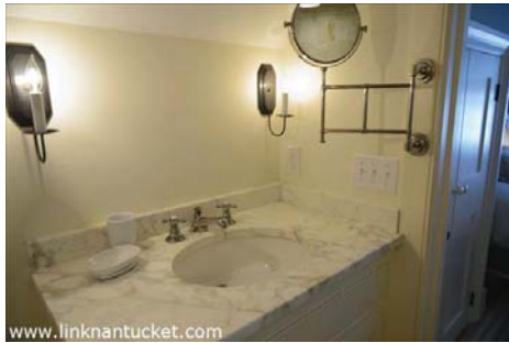
2nd Floor Bath