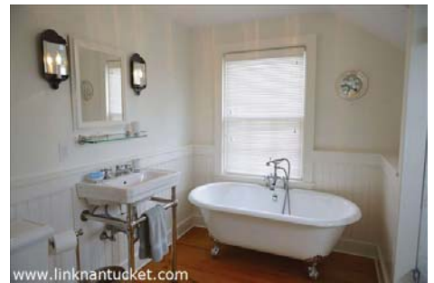
2nd Floor Master Bath