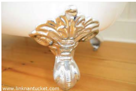
2nd Floor Master Bath Detail