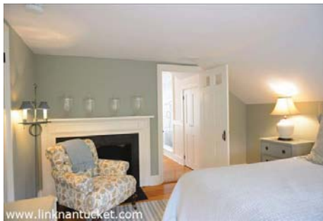
2nd Floor Master