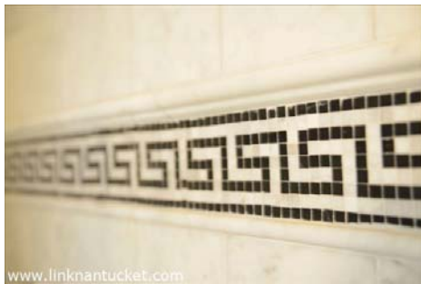
1st Floor Master Bath Detail