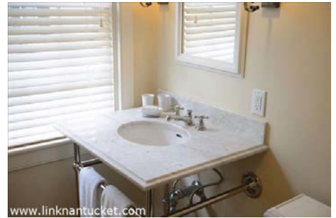
1st Floor Master Bath