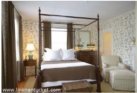
1st Floor Master