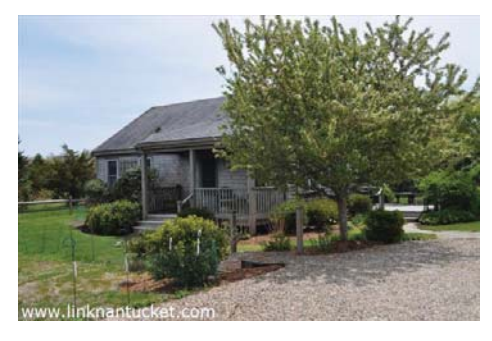
Cottage "Bee Hive"