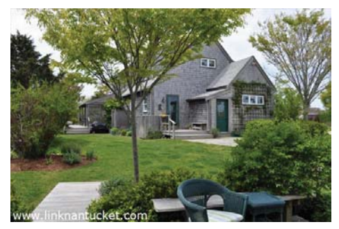
Main House from Cottage