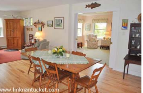
Great Room Sitting area