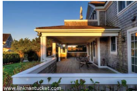
View from the beach just a stone's throw away from the property