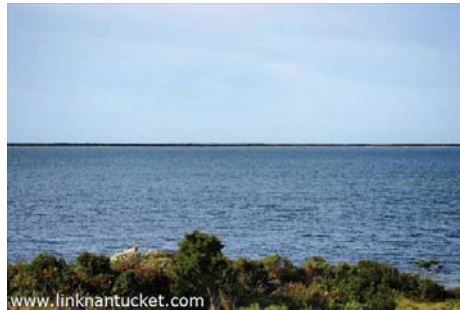
Expansive views of the Harbor, Coatue and Great Point Light