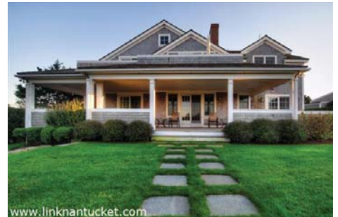
7 Village Way enjoys spectacular afternoon light which can be enjoyed from the porch or