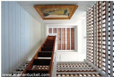
First Floor Up to Cupola