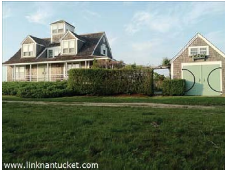
House and Studio