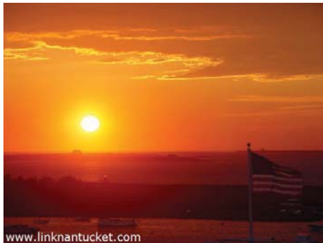
Sunset from Master