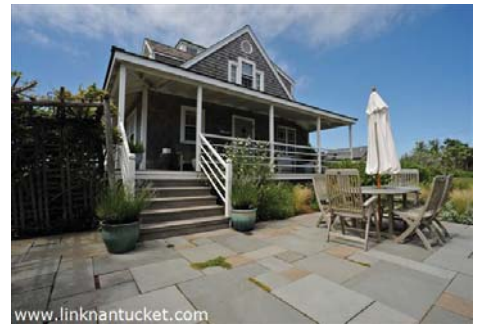
Patio and Porch