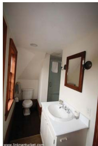
Bath to second floor rear bedroom