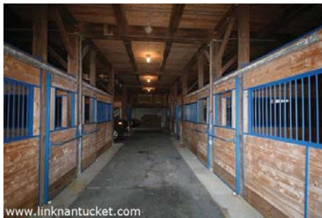
Horse barn interior