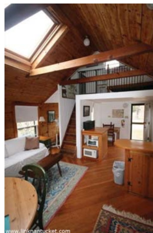
Guest cottage living area and loft