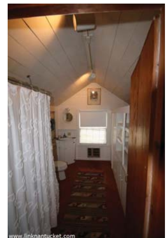
Guest cottage full bath