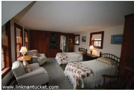
Second floor rear bedroom with full bath