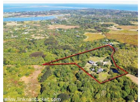
Aerial of area