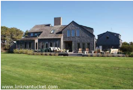
Main House And Garage with Studio