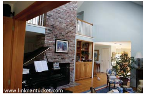
Main House Living Room