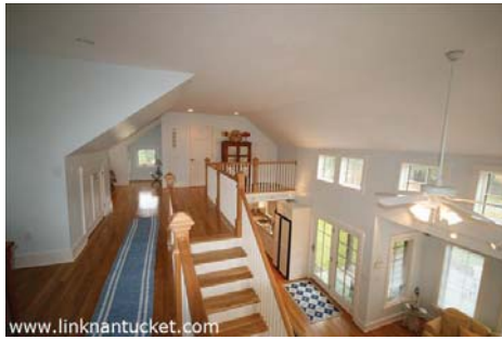
Cottage Loft Area