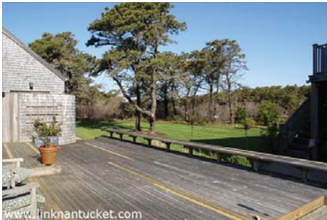
Main House Back Deck