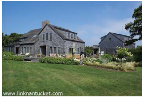
Main House and Garage with Studio