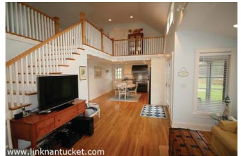
Cottage Living Room and Kitchen