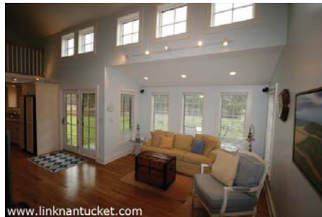
Cottage Sitting Area