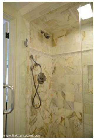
2nd Floor Bath