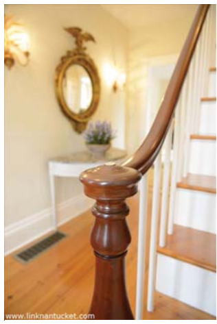
Newel Post with Ivory Token