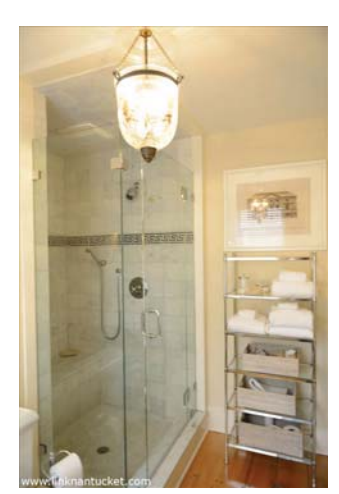
1st Floor Master Bath