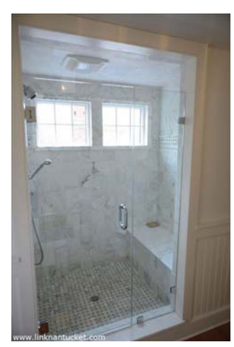
2nd Floor Master Bath