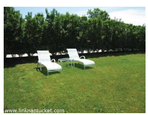
Corner of the yard