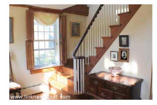
Foyer. Note the shutters.