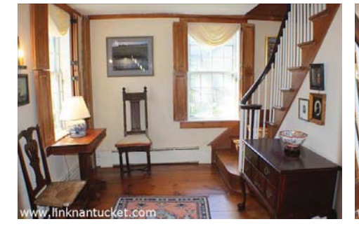
Large Foyer Invites You Into 11 Milk Street.