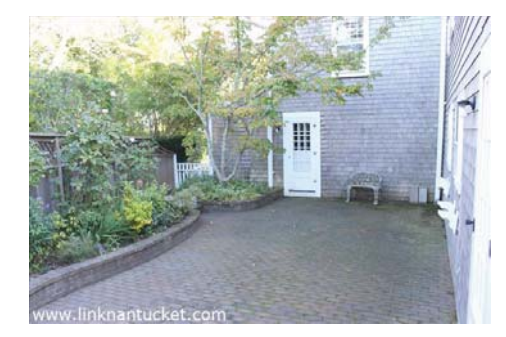
Large Patio with Perennial Garden.