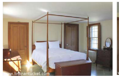
Owner's Bedroom not Subject to Protective Covenants.