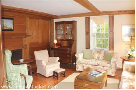
Note How Sunshine Fills the Front Parlour.