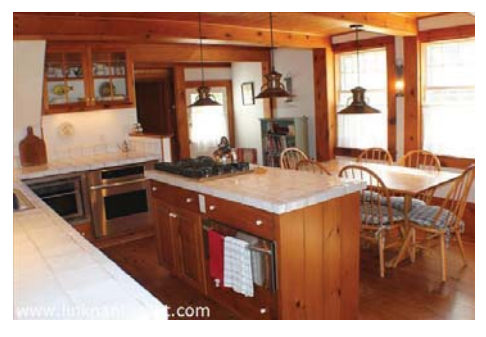
Large Windows Face South West. Note Oven plus Convection Microwave.

Kitchen not Subject to Preservation Restriction.