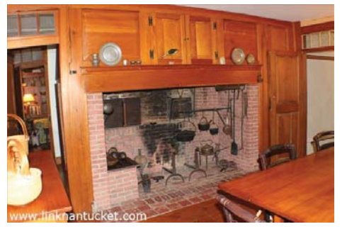
The Fireplace is the Focal Point of the Dining Room.