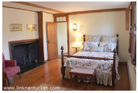
"Middle" Bedroom with Private Bath.