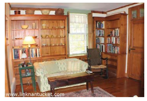
The Bourning Room is Lined with Bookshelves.