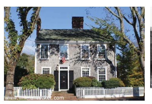
The Thomas Starbuck House