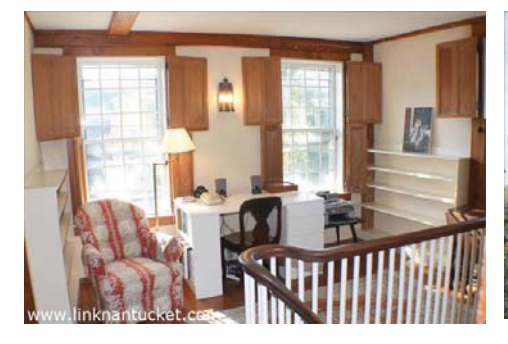
Office Area at top of Stairs Overlooks Milk Street.