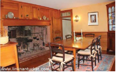
A Larger Dining Room Table can Easily Accomodate 8-10.