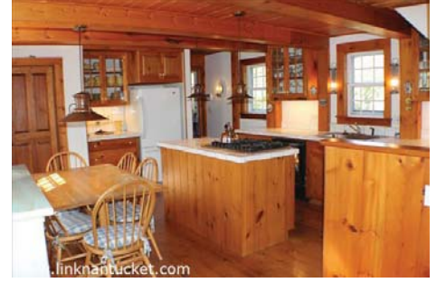
Lovely Eat in Kitchen with Island.