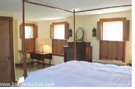
Anothe View of Owner's Bedroom. Door Shown leads to Attic.