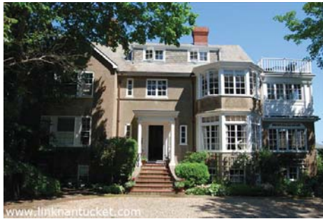
Entrance to the first floor