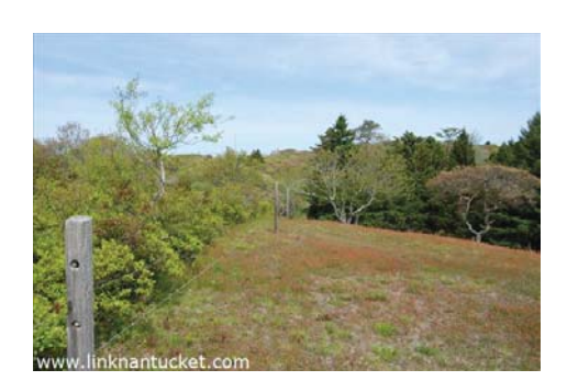
Northwesterly view toward Quidnet Road.