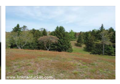
Rolling topography makes for an interesting setting.