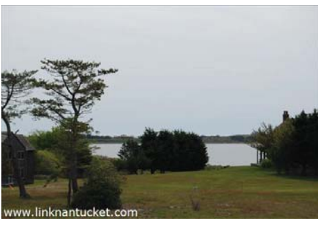
Pond View between abutting homes.