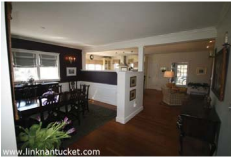
Dining and hall area