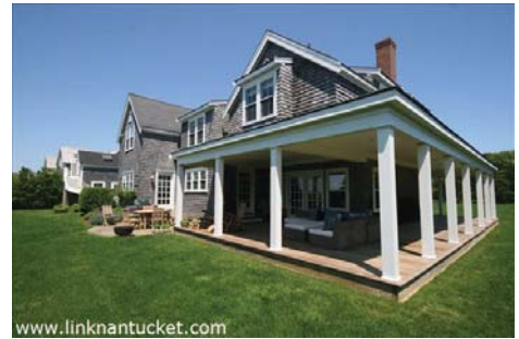
Rear covered porch