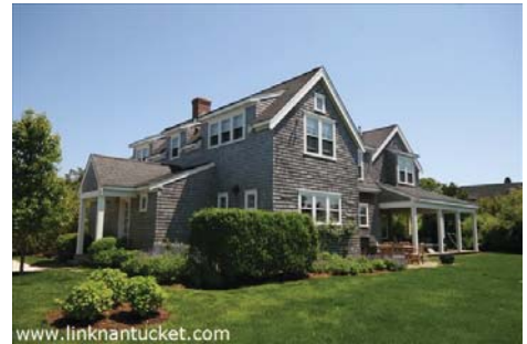
Side entry and rear portion of house