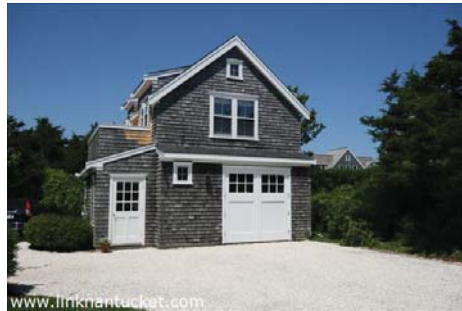
Garage with unfinished studio space