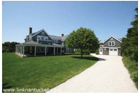
Front with garage/unfinished studio