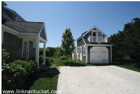
Side entry of main house and studio office