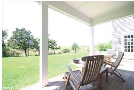
Porch overlooking the lawn