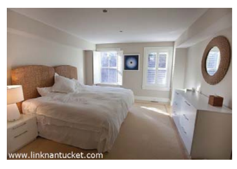
1st floor bedroom