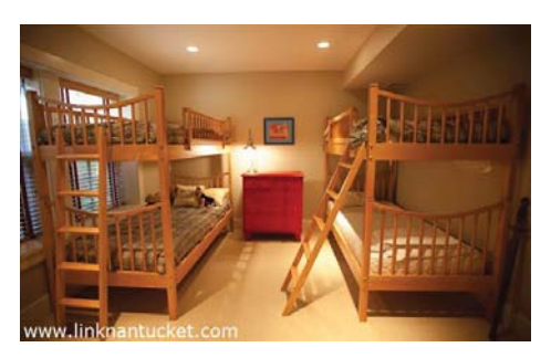
Bunk Bedroom lower level