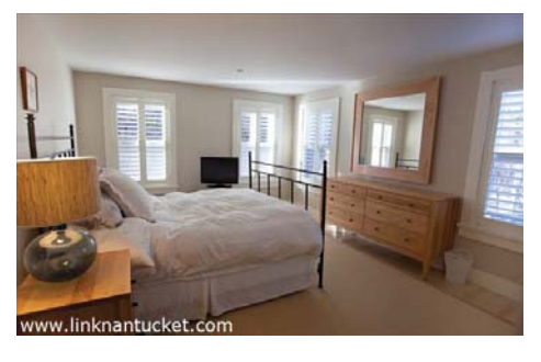
2nd Bedroom on the 1st floor