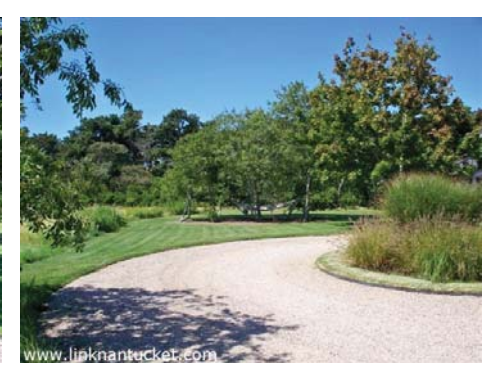
Driveway turn around