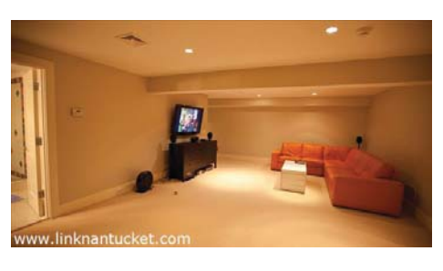
Family room on lower level