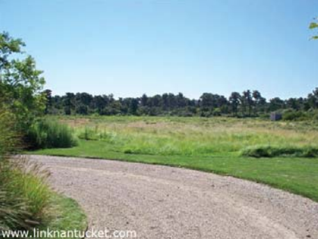
View of the acreage