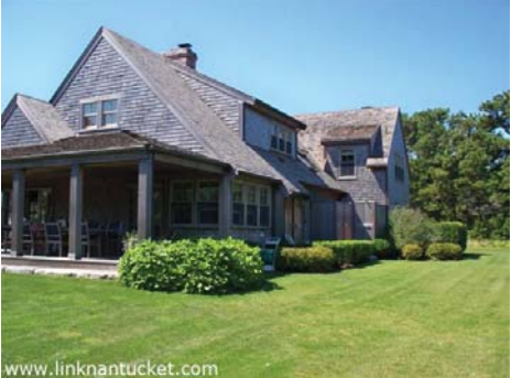
View of the back of the house