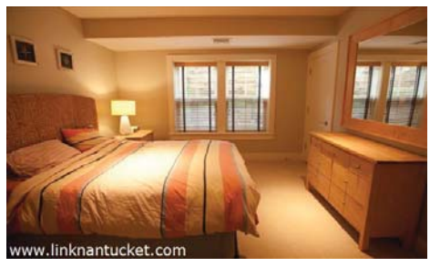
4th Bedroom Lower level