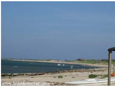
view of beach toward Jetties and Galley Restaurant