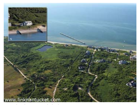
north shore aerial view