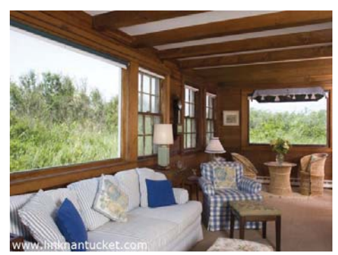
sunporch with western light