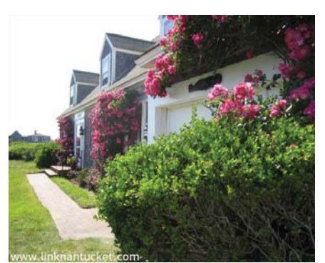
house & beach 2011