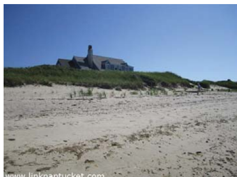
house & beach 2011