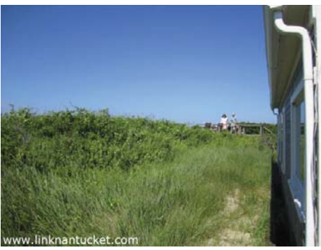
dune deck from ocean side of house