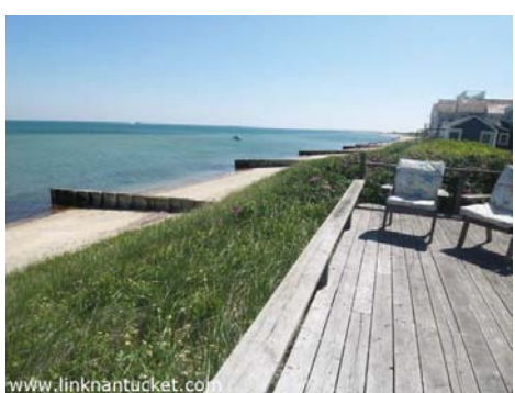
dune deck facing east