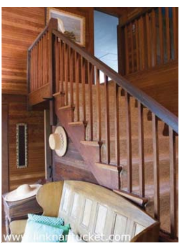
entrance stairwell to second story