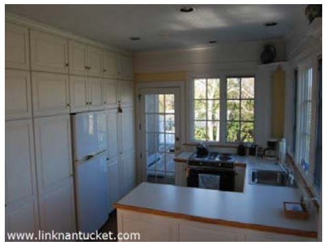
kitchen with view of deck