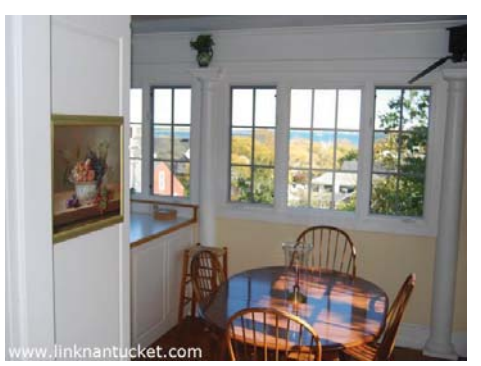
Dining room with view of the harbor