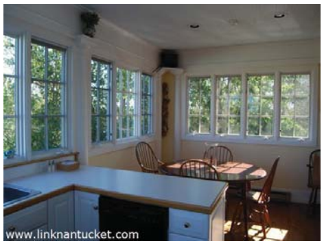
kitchen/ dining combined