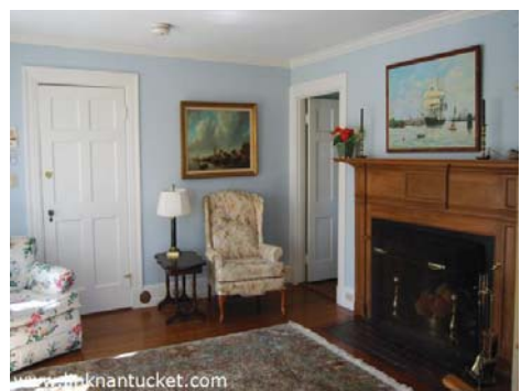
Fireplace in living room