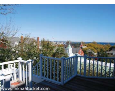
view from deck