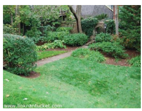
Yard and walkway to Main Street