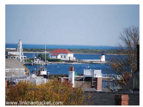
View from deck