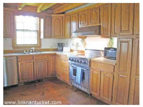
Kitchen with updated appliances