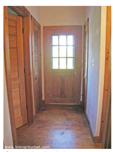
Short hall to the deck