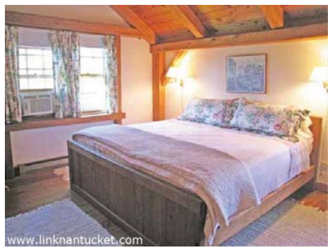
Master Bedroom 1st floor