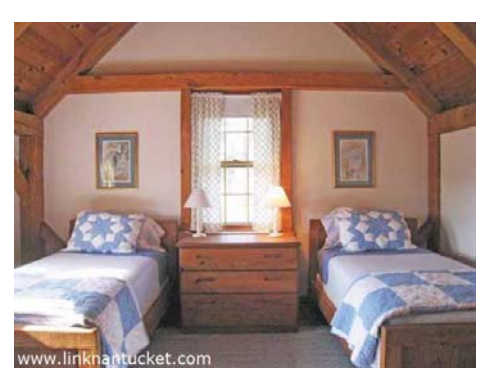
Bedroom #2 on 2nd floor