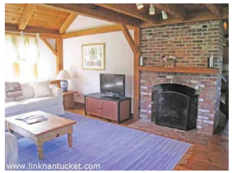
Wood burning Fireplace in Living area