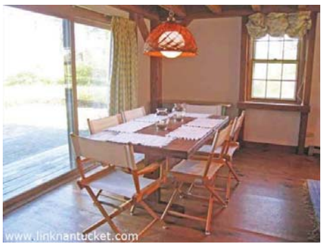
Dining area with sliders to the deck