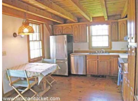
Dining area in the kitchen