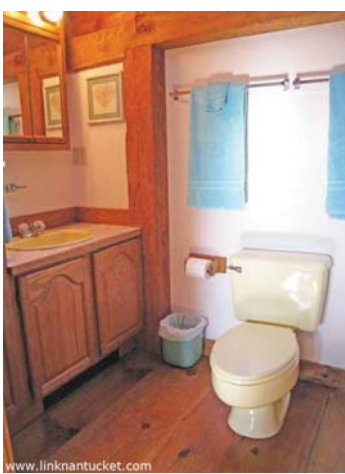
Shared bathroom with tub & shower