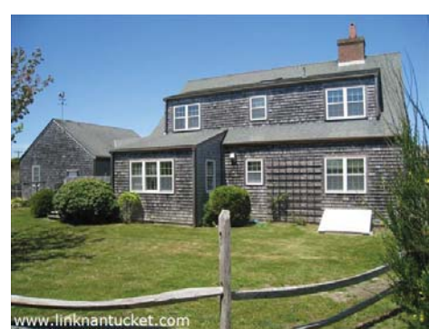
View from back yard