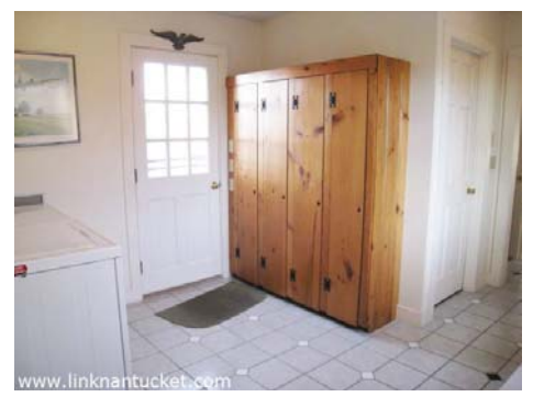
Laundtry room with exit to front yard