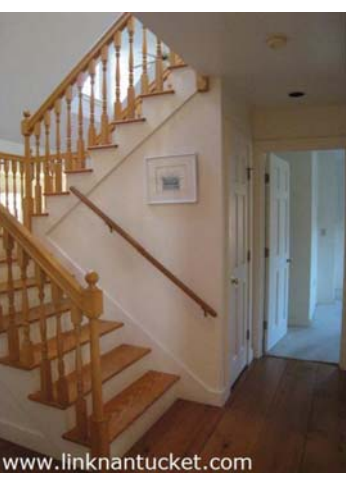
Short hallway to 1st floor Bedroom