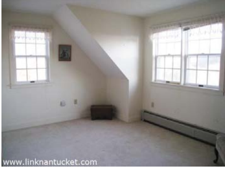
Guest Bedroom on 2nd Floor