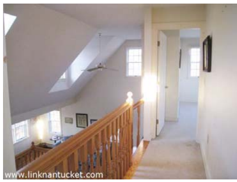
2nd Floor Landing