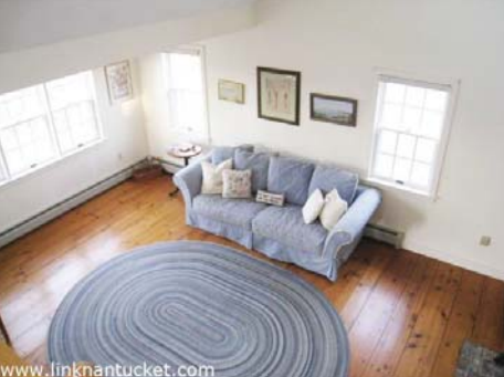
View from the staircase