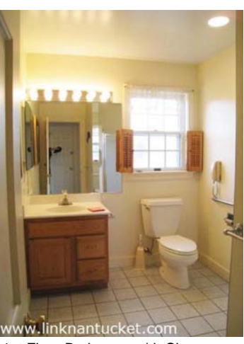
1st Floor Bathroom with Shower