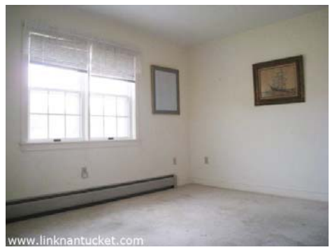
1st Floor Bedroom