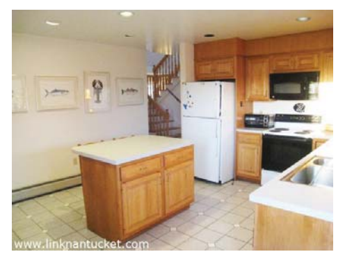
Breakfast room open to kitchen