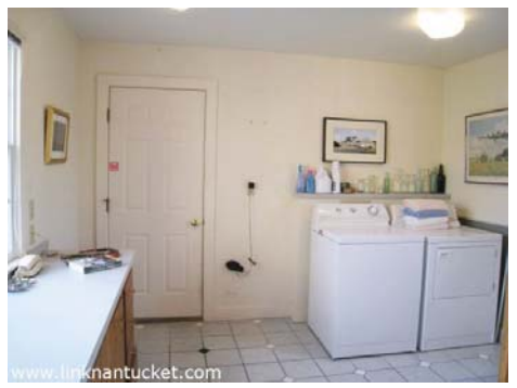
Laundry room with door to garage