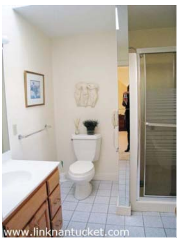
Private Master Bath with footed tub & shower